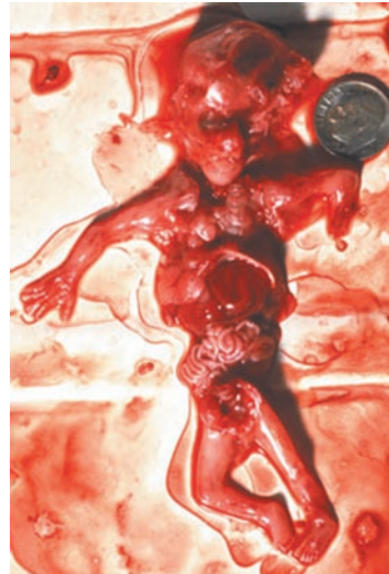
One of the thousands of children killed every day by abortion

Last year, Stericycle was investigated and fined in the state of Texas for illegally dumping aborted fetuses into a municipal landfill. In the process, local Stericycle representatives admitted to government officials that the company protocol is to transport fetuses to an incineration plant for disposal.