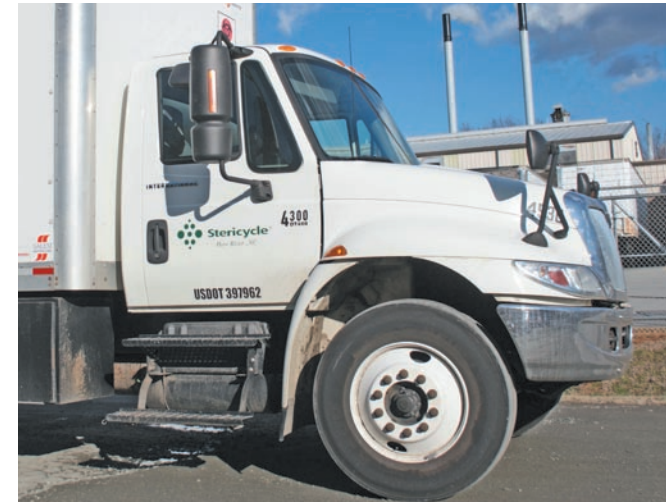
Stericycle's Haw River incineration plant, where aborted children from over 20 states are burned into ash.

The future of our nation's children is going up in smoke. Children should be cherished, not treated as trash.