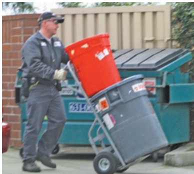
Stericycle wheels out "pathological waste" from Planned Parenthood in Sacramento, CA

Stericycle is the premiere "waste" service to the abortion industry, and as such is one of the top facilitators of the abortion holocaust. Abortion mills cannot operate without their help. With their greed, coupled with lack of conscience and ethics regarding human life, billion-dollar Stericycle is aiding and abetting abortion mills and keeping them in business. As a result, 4,000 children continue to be killed every day by the evils of abortion.